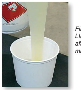
Firestone's LVOC after mixing***