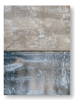
Firestone's Single-Ply LVOC Adhesive; Flashoff time 15 mins. 20 °F