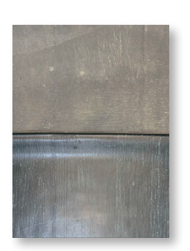
Competitor's Single-Ply LVOC Adhesive; Flashoff time 23 mins. 20 °F