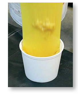
Competitor's LVOC after mixing***