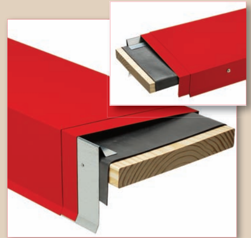
UNA-Edge™ CO Coping System