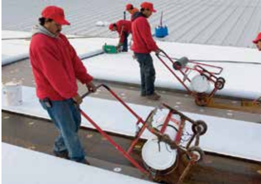
Firestone XR Bonding Adhesive

UltraPly TPO XR can be mechanically attached or fully adhered using XR Bonding Adhesive, hot asphalt, or XR Stick Adhesive.