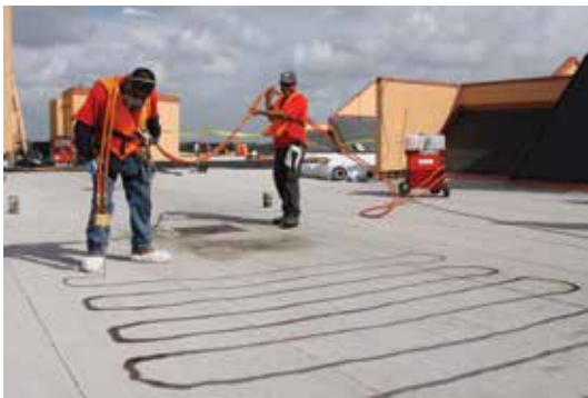
Firestone XR Stick Foam Adhesive